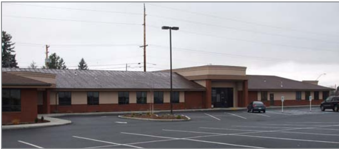
SUMMITVIEW MEDICAL OFFICE BUILDING Yakima, WA